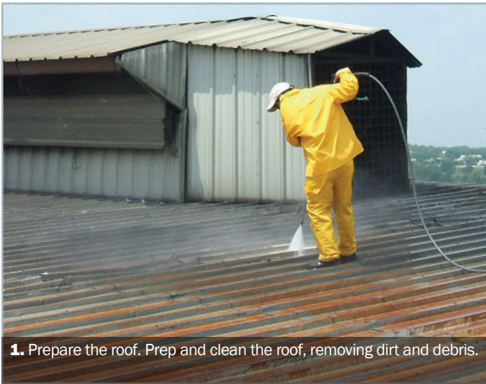
1. Prepare the roof. Prep and clean the roof, removing dirt and debris.