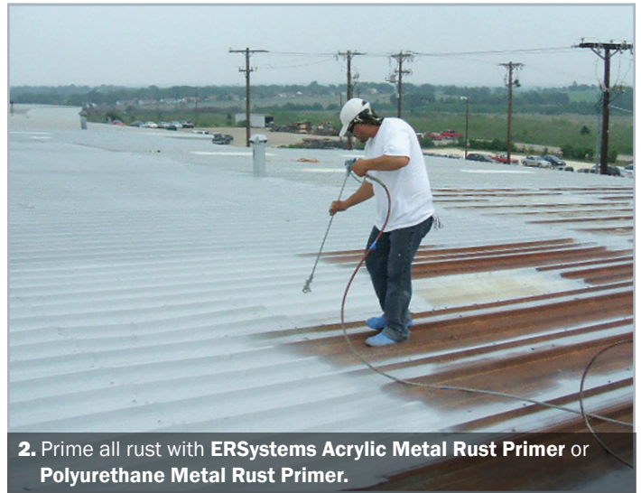
2. Prime all rust with ERSystems Acrylic Metal Rust Primer or Polyurethane Metal Rust Primer .