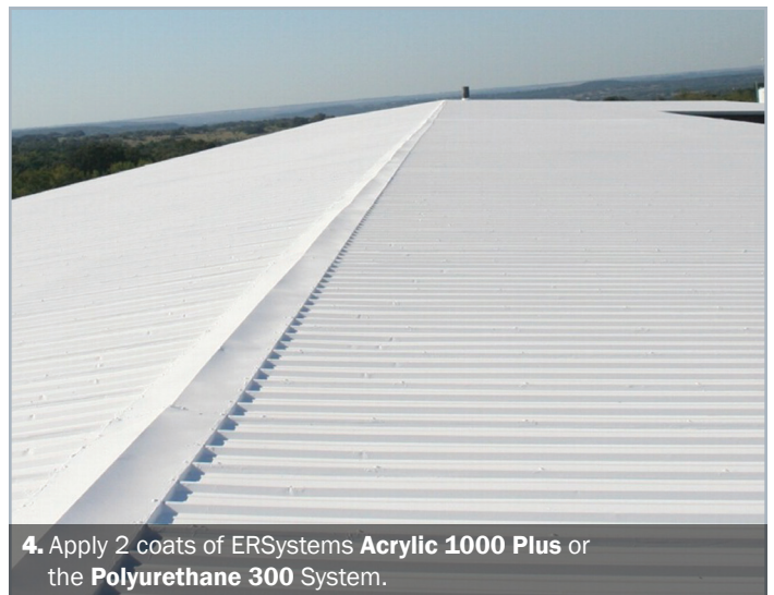
4. Apply 2 coats of ERSystems Acrylic 1000 Plus or the Polyurethane 300 System .