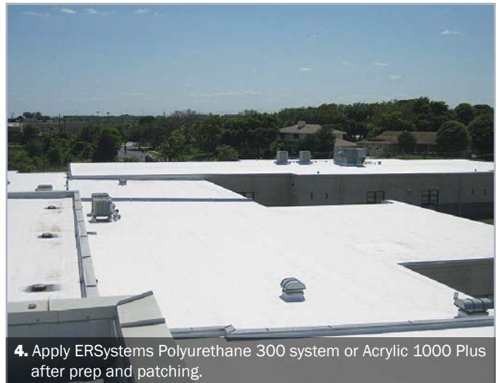
4. Apply ERSystems Polyurethane 300 system or Acrylic 1000 Plus after prep and patching.