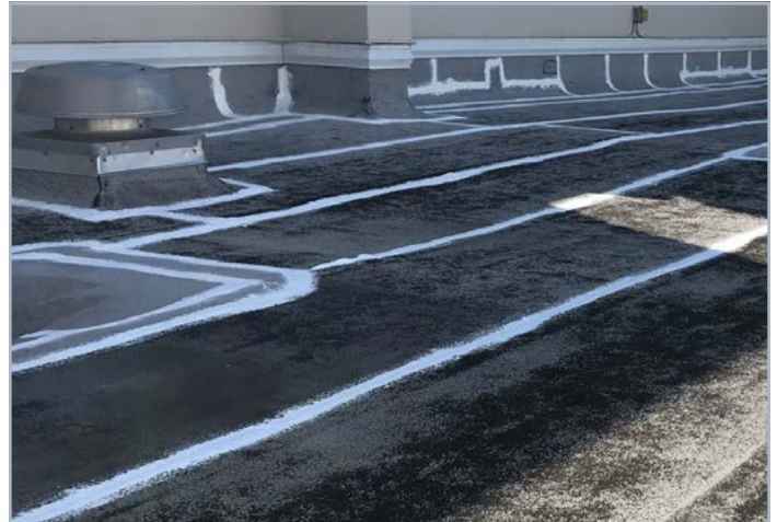
2. SEAL AND REINFORCE around penetrations and flashings.