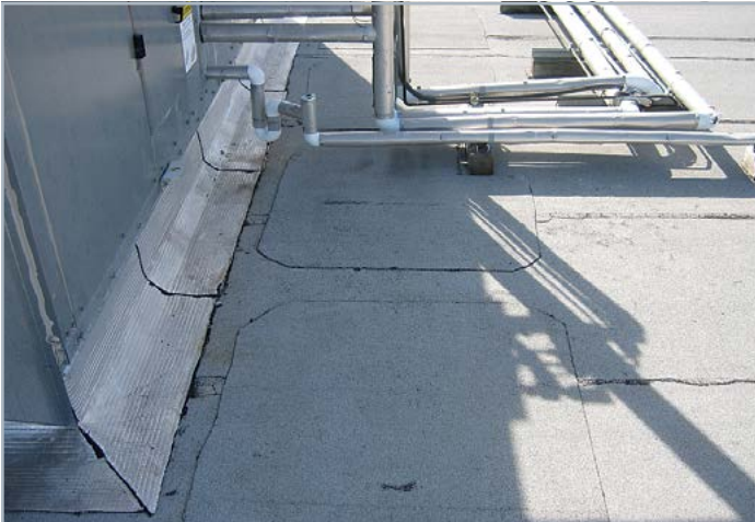
1. Repair and replace any deteriorated areas with LIKE MATERIALS to make WATERTIGHT .